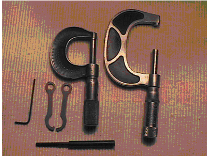
Two micrometers from the WWII era made by Reed Small Tool Works, Worcester Mass. along with smaller tools to calibrate zero point, were used by Lloyd I. Palmer at Scintilla.

The other micrometer starts measurements at one inch and will measure up to two inches total, obviously being for bigger items.