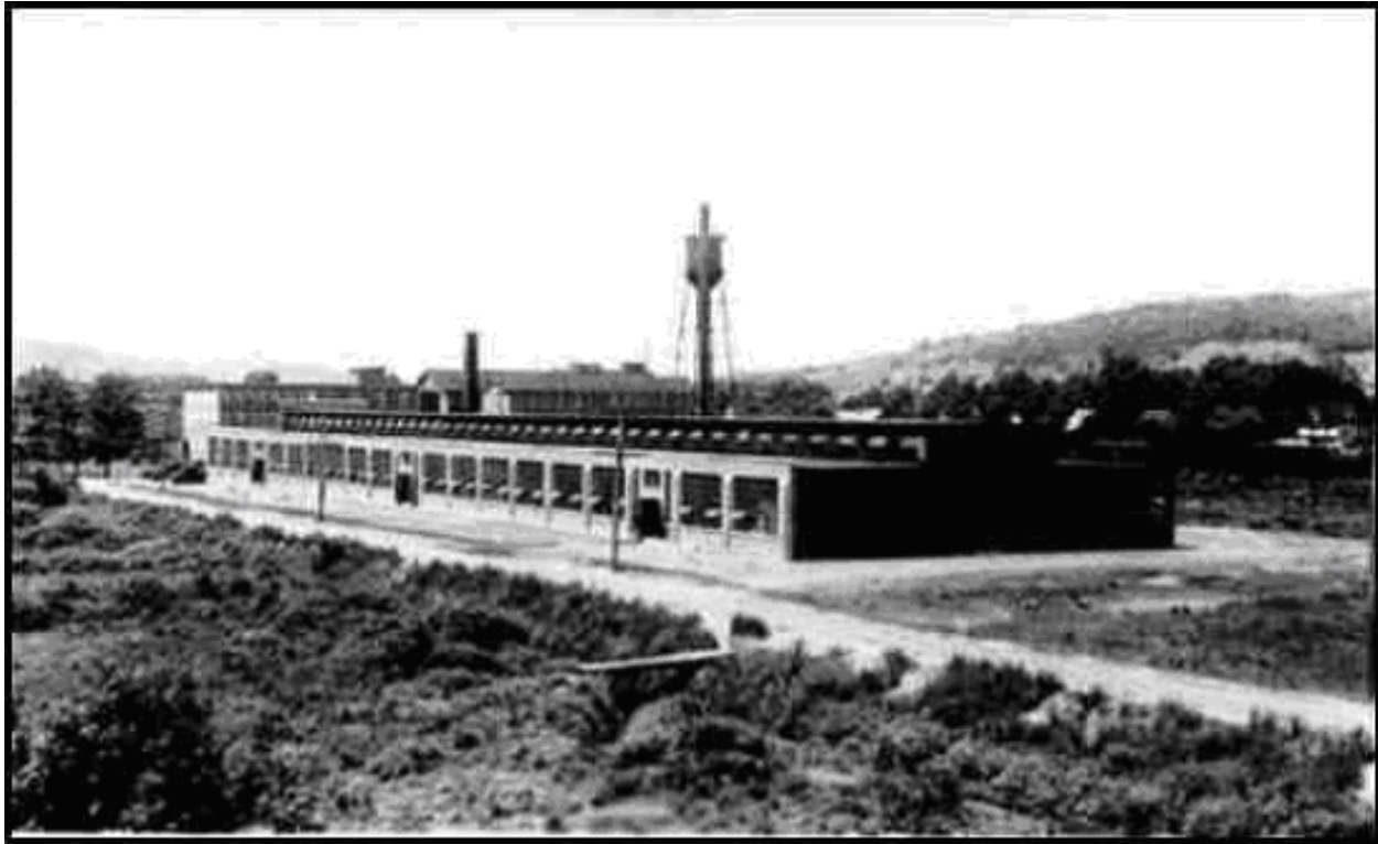
Plant at Sidney during the War