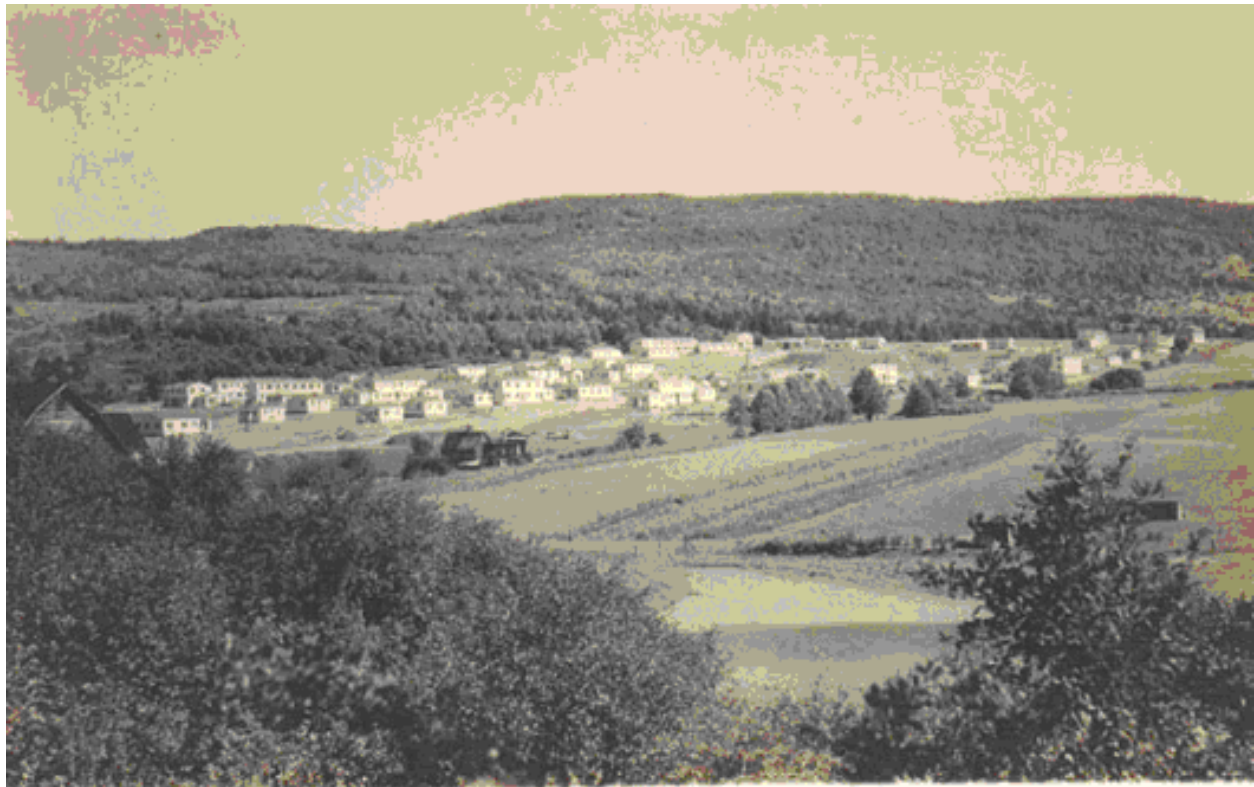
72—Defense Housing Project, "Sherwood Heights", Sidney, N. Y.