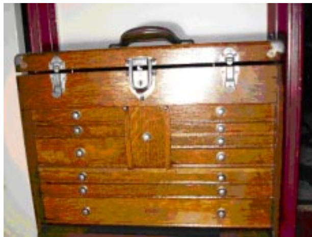
One of the many tool chests used at Scintilla. It now has a home in the author’s office and contains the micrometers plus other assorted tools.

It took a little investigation to find more about the “Scintilla Chest”. I correctly thought the chest was made by an outside company and was either recommended to the machinists or the machinists knew where to order this chest. Looking diligently for a nameplate or a label, none was found. But the old machinists were neat and orderly. The original card, found in a drawer describing care and maintenance, shows the manufacturer of the chest to be H. Gerstner and Sons from 3 Columbia Street in Dayton, Ohio.